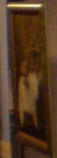
Portrait of the Artist Portrait of the artist, painted by the artist himself, 1860. Oil on canvas. The artist is depicted in a dark, voluminous coat, seated in a red upholstered chair. The background is dark, emphasizing the figure of the artist.