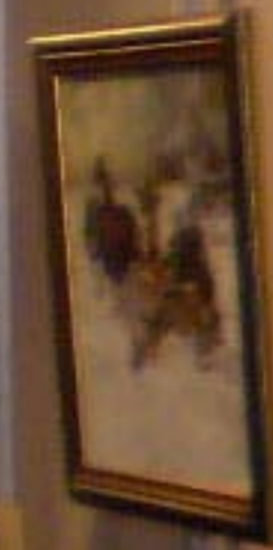
Portrait of the Artist Portrait of the artist, painted by the artist himself, 1860. Oil on canvas. The artist is depicted in a dark, voluminous coat, seated in a red upholstered chair. The background is dark, emphasizing the figure of the artist.