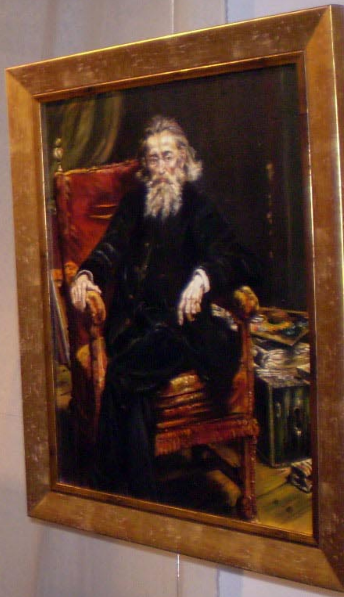
Portrait of the Artist Portrait of the artist, painted by the artist himself, 1860. Oil on canvas. The artist is depicted in a dark, voluminous coat, seated in a red upholstered chair. The background is dark, emphasizing the figure of the artist.