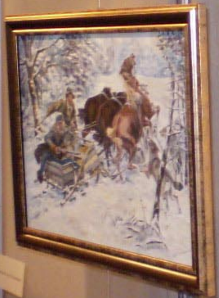
Winter Scene Winter scene, painted by the artist, 1860. Oil on canvas. The scene depicts a group of figures on horseback and a sled in a snowy landscape.